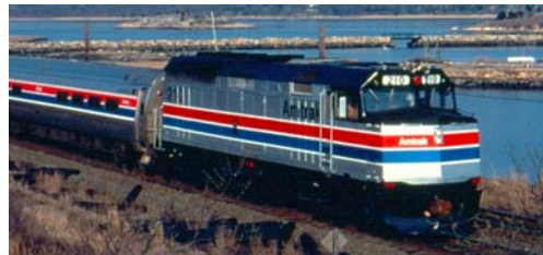
Paint scheme: Phase II – introduced 1975 In photo: F40PH #210 To be adapted to: P-42 #66