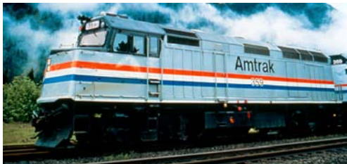
Paint scheme: Phase III – introduced 1979 In photo: F40PH #359 To be adapted to: P-42 #145