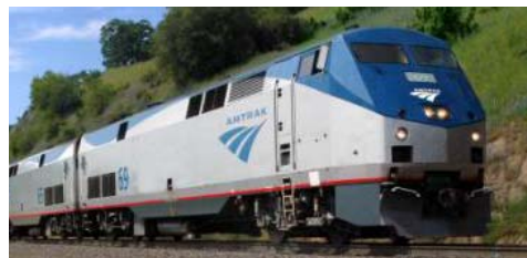
Paint scheme: Phase V – introduced 2001 In photo: P-42 #163 Current paint scheme