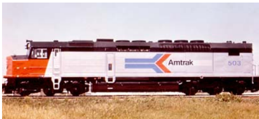
Paint scheme: Phase I – introduced 1972 In photo: SDP40F #503 To be adapted to: P-42 #156

The photos below are representative of the different paint schemes, also known as phases. As each locomotive becomes available for service, Amtrak will issue a Twitter message at twitter.com/Amtrak and post a photo in the Photos tab on its Facebook page at facebook.com/Amtrak .