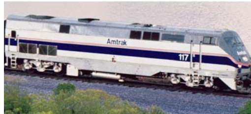
Paint scheme: Phase IV – introduced 1993 In photo: P42 #117 To be applied to: P-42 #184